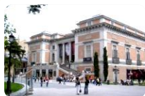
EL PRADO MUSEUM INSIDE VISIT

Other services or extras Insurance Beverages during meals Lunch or Dinner Porters at the airport or hotels Tipping Luggage services